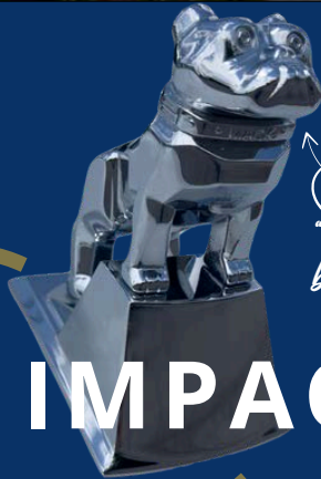
"Mack" the bulldog emblem

Five years ago, thanks to a generous donor working through the Hamilton Community Foundation, United Pet Fund (UPF) received an Isuzu box truck, fondly named Suzy. She quickly became an essential part of UPF's mission, transporting pet food and critical supplies to animal rescues and shelters across the region.